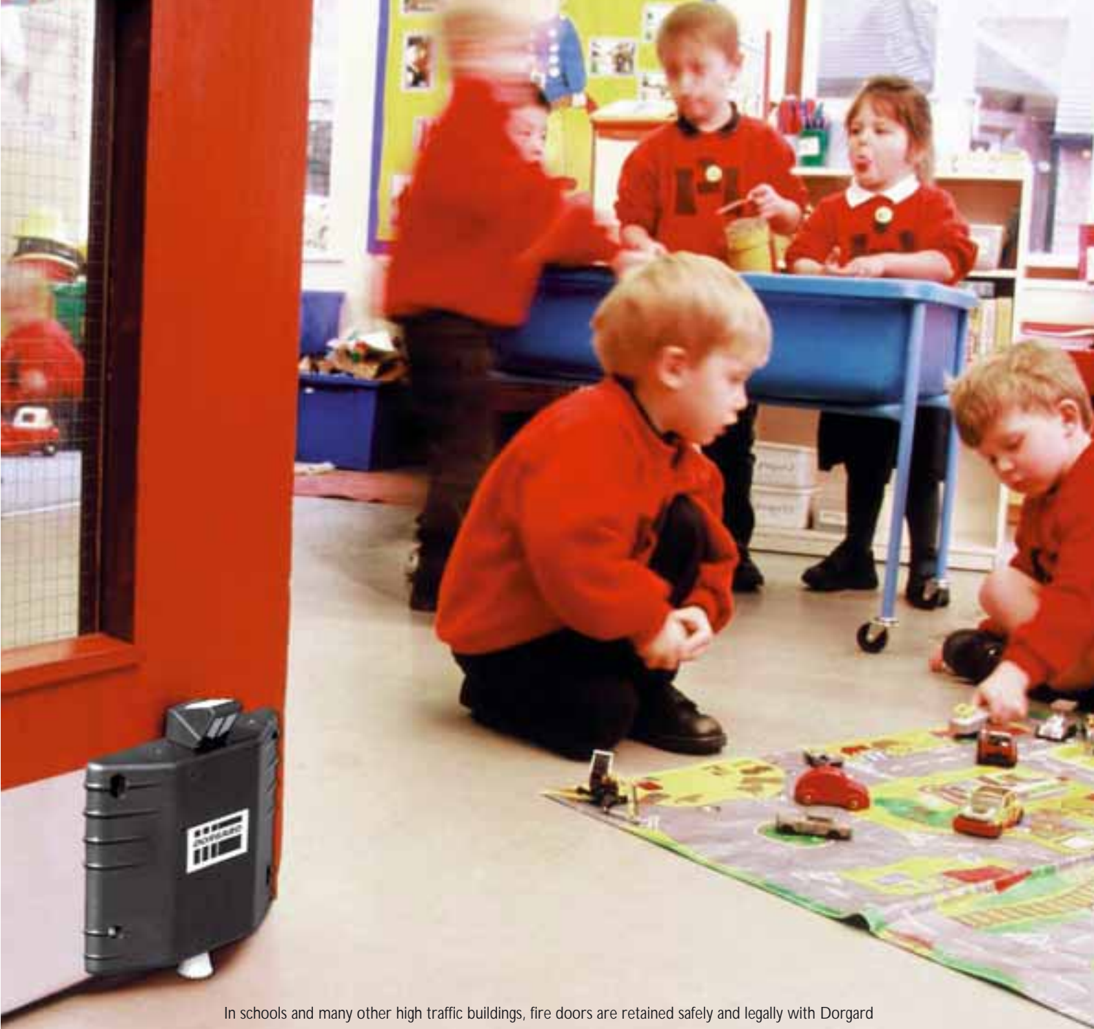
In schools and many other high traffic buildings, fire doors are retained safely and legally with Dorgard